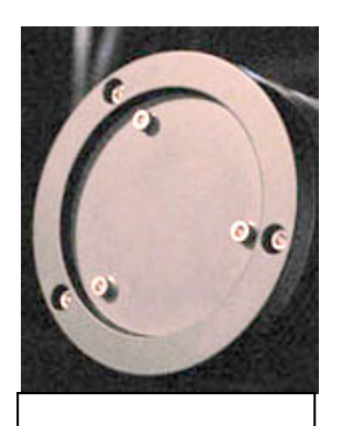
Figure 2. Meade sixscrew secondary.

In 2005 Meade began shipping their SCT models with a new secondary design that has six factory screws instead of three (Figure 2). The three inner screws are collimation screws, and the three outer screws attach the secondary assembly to a fixture in the corrector plate. Each collimation screw passes through a coil spring and threads into the secondary backing plate. These springs provide tension on the secondary to hold it in position, and correct tension can be maintained over one or two turns of a collimation screw, rather than the fraction of a turn in the three-screw design. Also, access to the secondary mirror is now possible without removing the corrector plate.